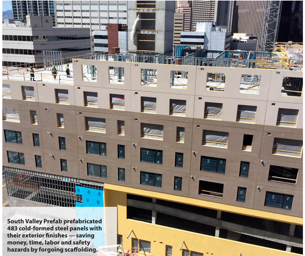
South Valley Prefab prefabricated 483 cold-formed steel panels with their exterior finishes — saving money, time, labor and safety hazards by forgoing scaffolding.